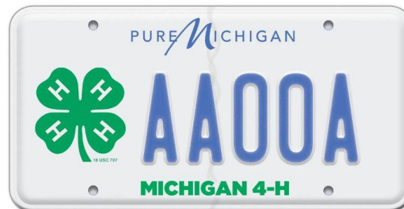
Draft plate; not final version.